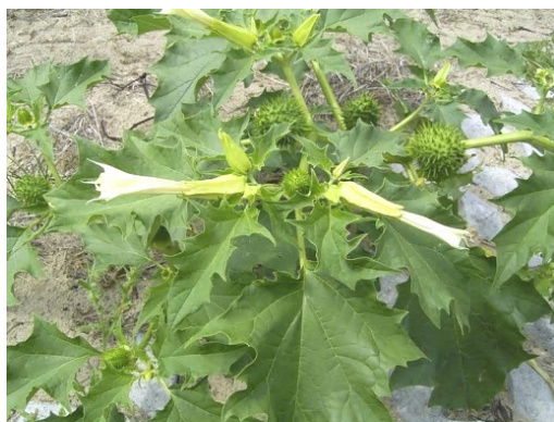
Figure 1. Datura Stramonium in blossoms

Datura Stramonium ( D. Stramonium ) is a weed from the family Solanaceae , the potato or nightshade family. The plant is native to Asia, but is also found in the West Indies, Canada, and the United States (Figure 1).